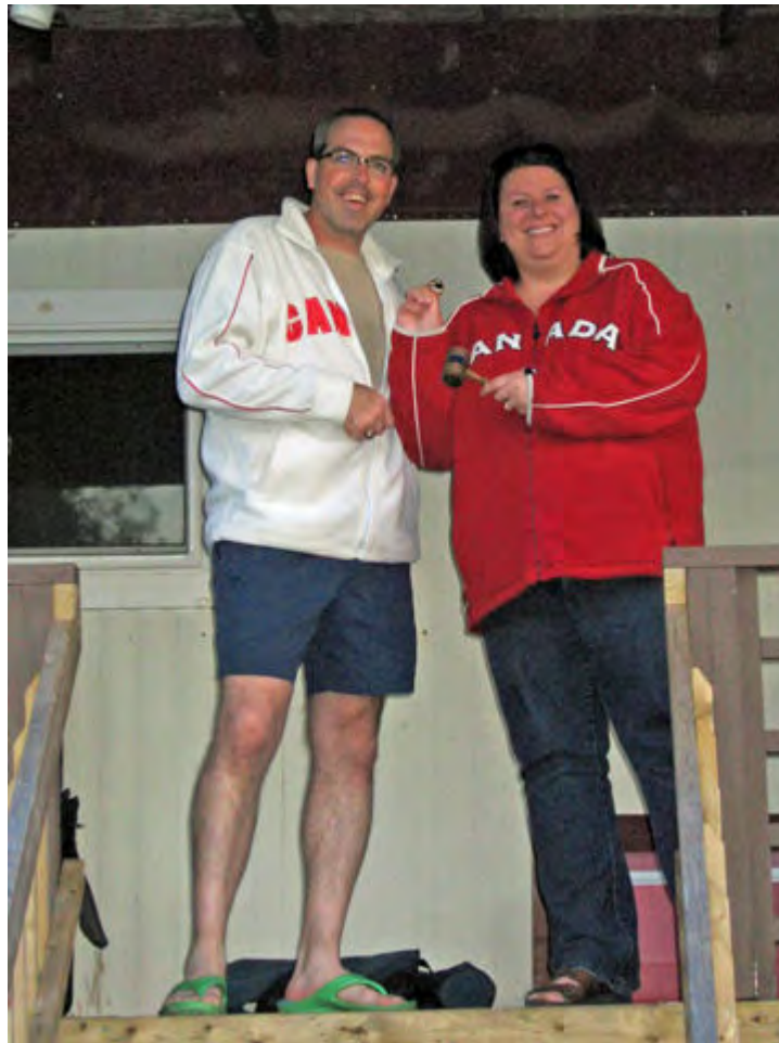
Passing of the gavel