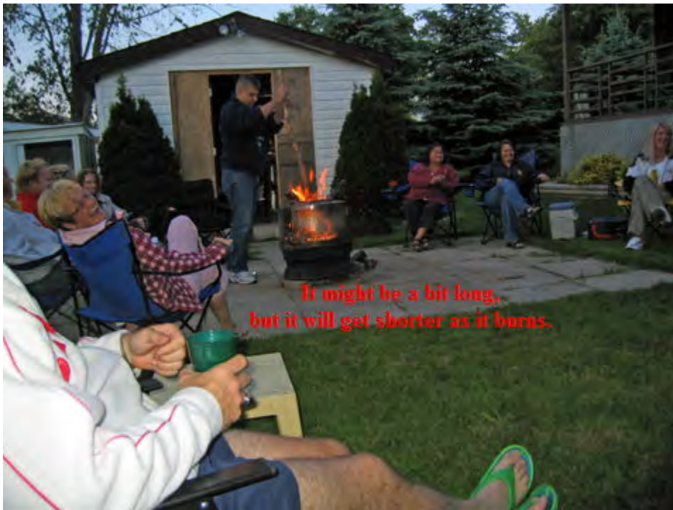
Stoking up the bon fire

It might be a bit long, but it will get shorter as it burns.