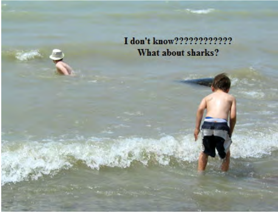
Banjo had a great time running on the beach