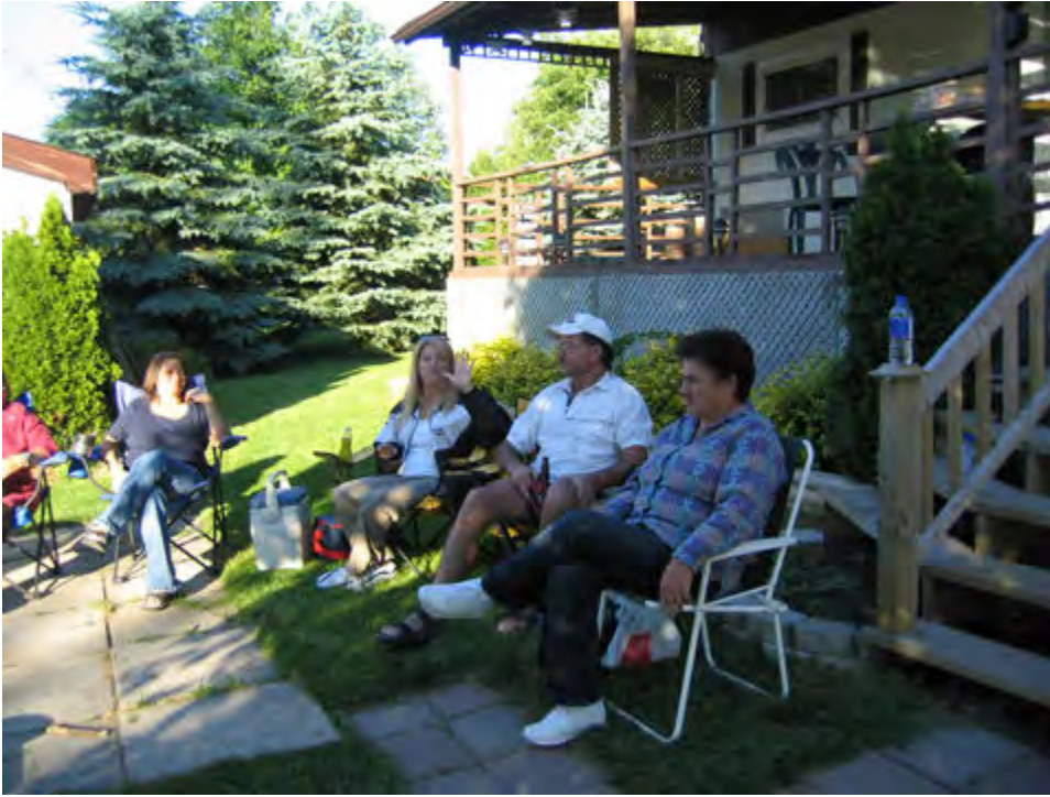
Members of the ball team enjoying the warm evening.