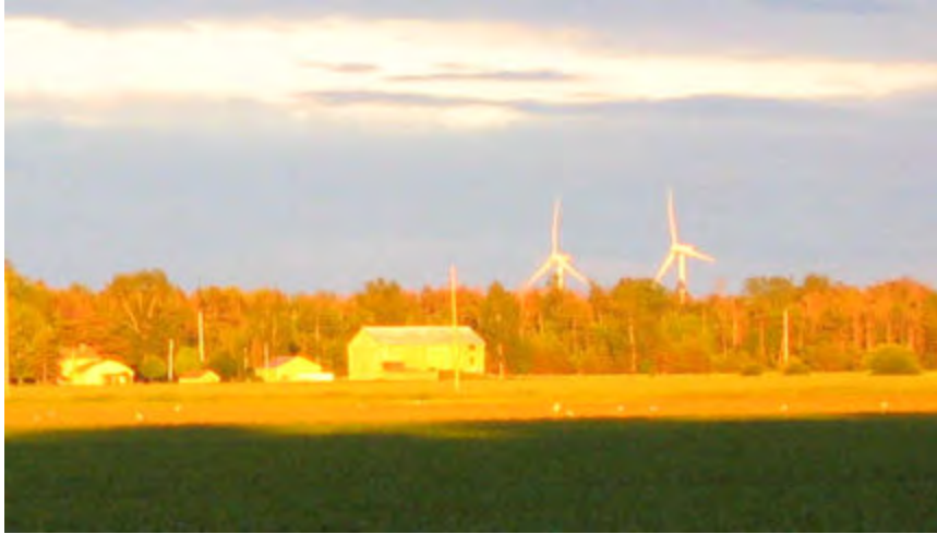
The view beside our lot.